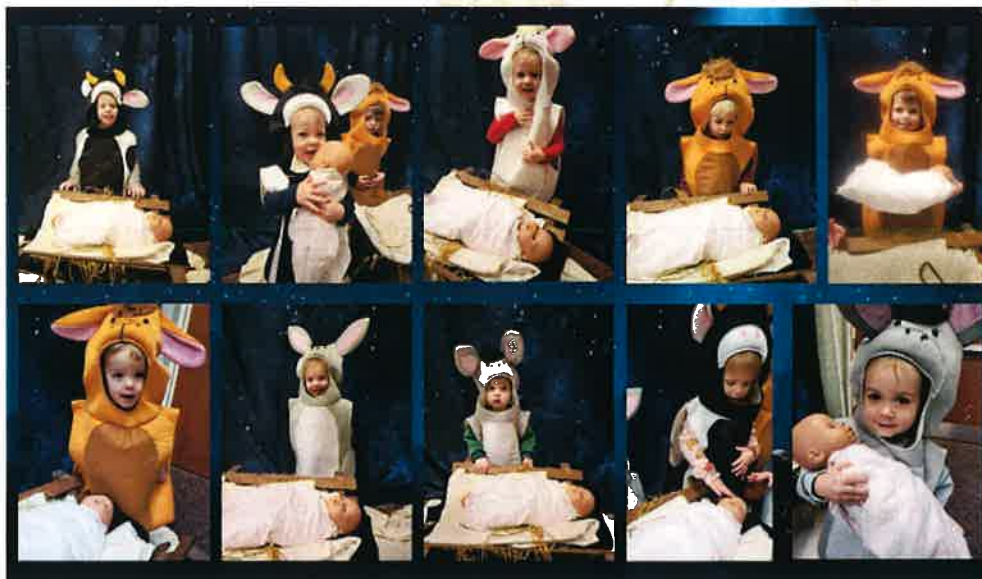
OUR BARNYARD ANIMALS