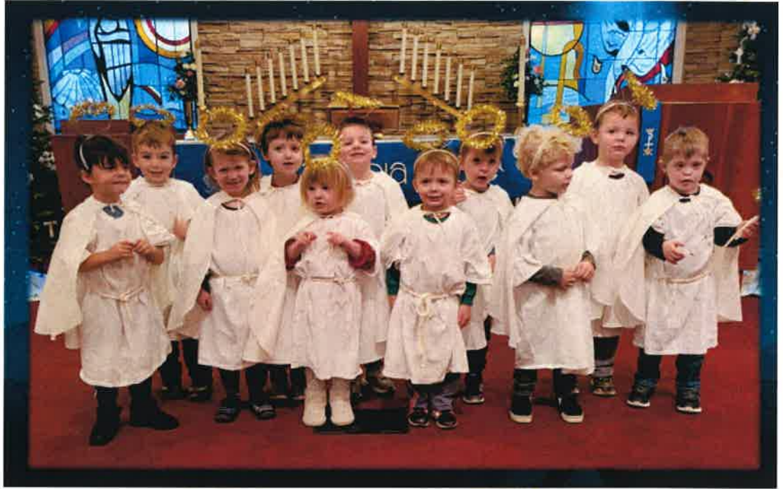
OUR CHOIR OF ANGELS