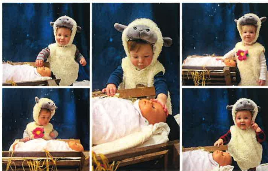
OUR WEE TODDLER LAMBS