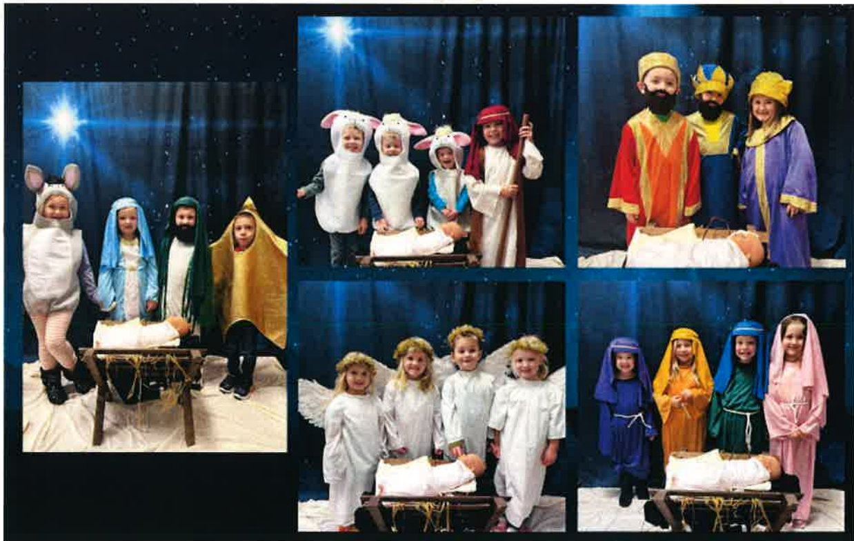
OUR NATIVITY CREW