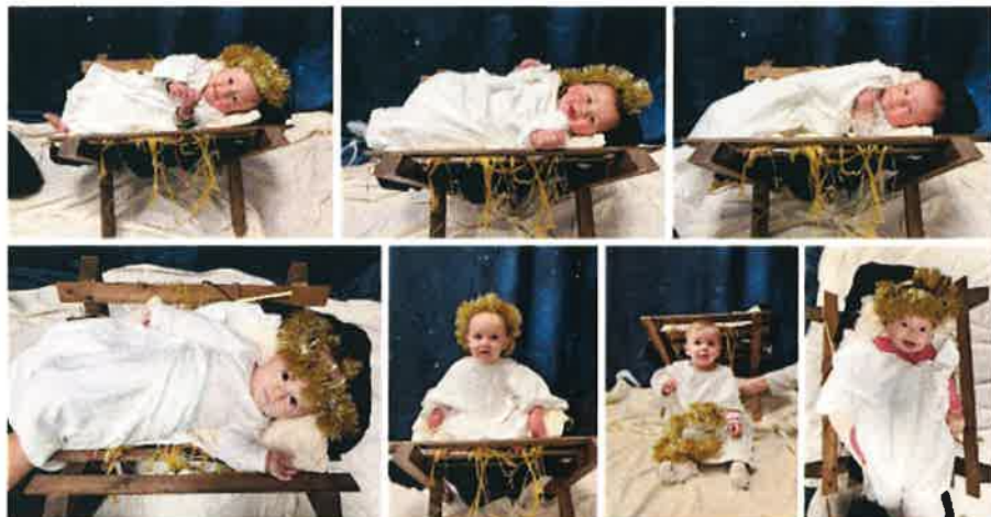
OUR BABIES JESUS